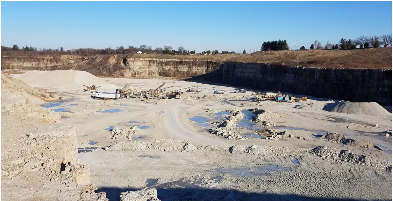
Cretex Materials, Inc. – Quarry in the Town of Burlington

Racine County has a moderately abundant supply of sand and gravel deposits. Potential sand and gravel deposit areas are shown on Map 8. This indicates the potential non-metallic mining resources are available under 130 square miles, or 38 percent of the total land area of the County. These areas are concentrated in the western portion of the County in the outwash areas, particularly west of the Fox River, where the washing action of glacial meltwaters has sorted the sand and gravel into somewhat homogeneous deposits, that are commercially more attractive. Therefore, the most abundant sources of the sand and gravel occur in the Towns of Waterford and Burlington as well as the Village of Rochester. In addition, there are many other small deposits scattered throughout the remainder of the County. The occurrence of such deposits is extremely variable, and onsite investigations are necessary to determine the suitability of any given site for sand and gravel or rock extraction purposes.