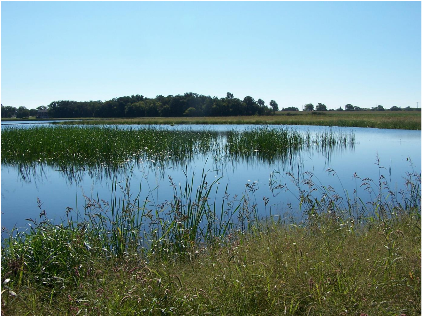
Restored Wetland located in the Town of Dover, Racine County