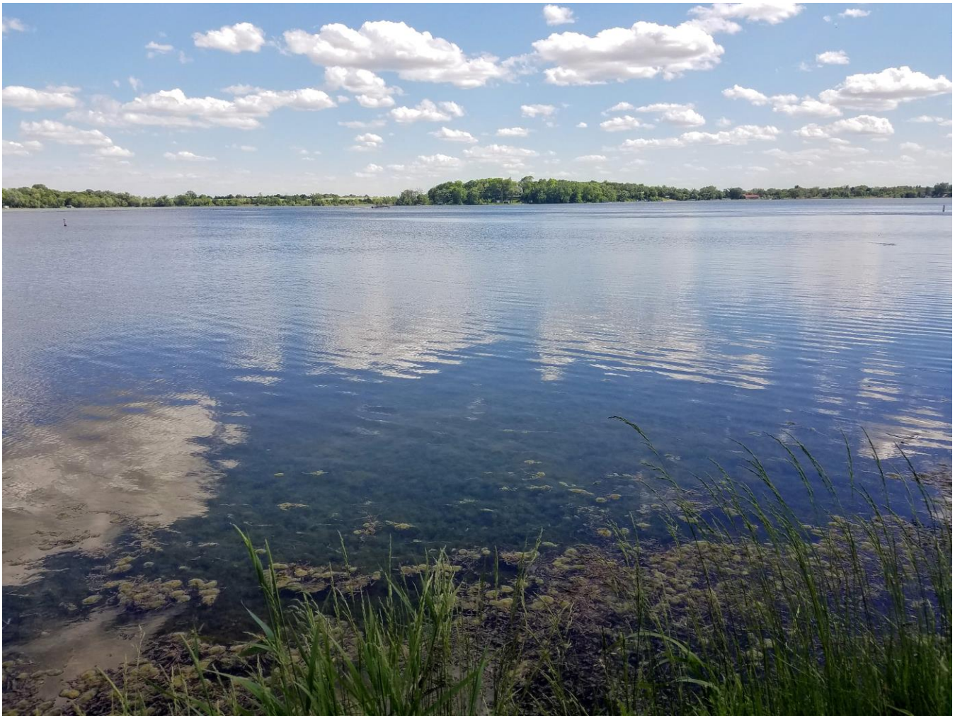
Eagle Lake, Town of Dover, Racine County