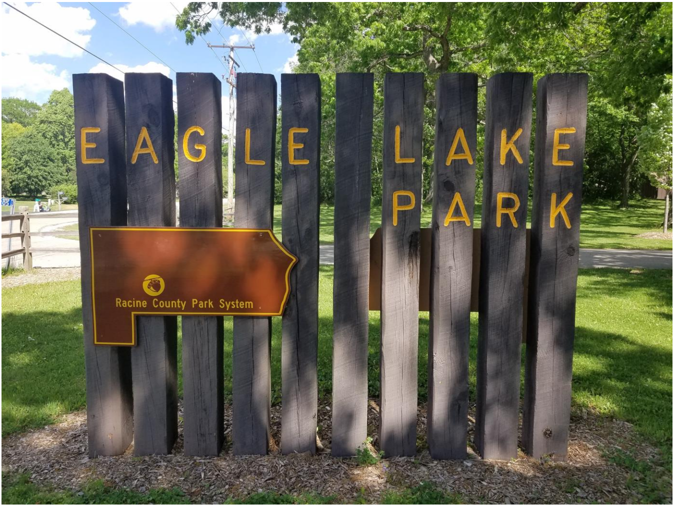
Eagle Lake Park, Located in the Town of Dover