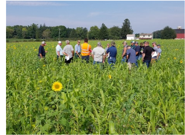
Field of cover crops on display at the WPCR Summer Field Day

The WPCR held a summer field day at Weis Farms in Burlington on September 10 th . The field day featured a soil pit, cover crops, planting green, and a soil runoff simulator. The next winter workshop will be in early February, featuring farmer Rick Clark talking about his soil health journey.