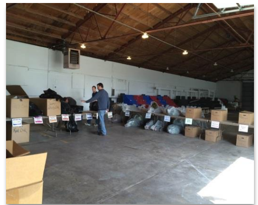
2014 Tree Program Setup

For those of you who ordered trees, shrubs, or seed mixes from the Racine County tree sale this year; the tree pick up dates are scheduled for Tuesday, April 21 st 1:00 p.m. to 6:00 p.m. and Wednesday, April 22 nd 8 a.m. to 6 p.m. at the Racine County Fairgrounds , tentatively. A notice will be sent to all addresses with tree orders if these dates are changed for any reason. Your receipt and pick up instructions will be sent out in the beginning of April, please bring your receipt with you when you pick up your trees. The County also has two tree planters available for rental, starting at $30 per planter. Contact Racine County Land Conservation at 262-886-8440 ext. 3 to reserve one today.