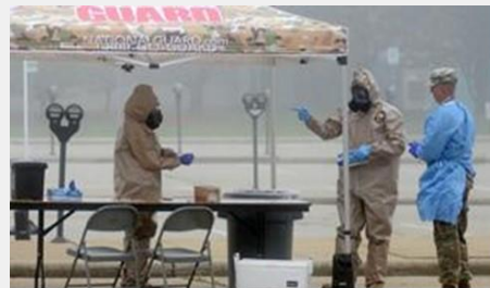
Click picture for a listing of current COVID Testing sites.

Tues. – Thurs., Aug. 4-6, 10 am - 6 pm and Tues. – Thurs., Aug. 18-20, 10 am – 6 pm