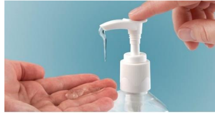
Please Read! FDA advised consumers not to use any hand sanitizer manufactured by "Eskbiochem SA de CV" in Mexico, due to the potential presence of methanol , a "toxic alcohol", as an active ingredient, which can cause blindness and/or death when absorbed through the skin or when swallowed.

Serious adverse health events have been associated with methanol-based hand sanitizers. Most commercially available alcohol-based hand sanitizers or rubs (ABHSR) contain either ethanol or isopropanol as active ingredients. On June 19, 2020, the U.S. Food and Drug Administration (FDA) advised consumers not to use any hand sanitizer manufactured by "Eskbiochem SA de CV" in Mexico, due to the potential presence of methanol, a "toxic alcohol", as an active ingredient, which can cause blindness and/or death when absorbed through the skin or when swallowed. For more information, go to: https://www.fda.gov/drugs/drug-safety-and-availability/fda-updates-hand-sanitizers-methanol .