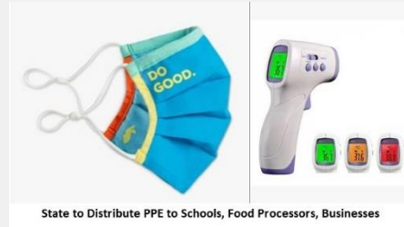
State to Distribute PPE to Schools, Food Processors, Businesses

MADISON — Gov. Tony Evers today announced additional efforts to distribute personal protective equipment (PPE) to schools, food processors, and businesses across the state. Wisconsin Emergency Management (WEM) will begin shipping more than 2 million cloth face masks and more than 4,200 infrared thermometers to K-12 public, charter, and private schools throughout the state. The Wisconsin Department of Agriculture, Trade, and Consumer Protection (DATCP) is also helping to facilitate the delivery of approximately 60,000 masks to local food processors and businesses. Click here for the full Press Release .